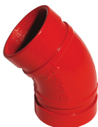
style 64 Coude 45°

Pression de service max: 34.5 bar. Contactez Modgal pour les informations sur la pression de service pour la protection incendie.